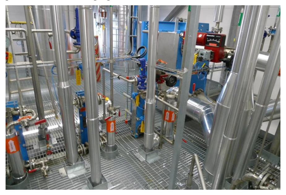
Photo – Part of raw distillery process plant. The whole distillery building is classified according to Atex regulations.

The distilled raw alcohol (~92% alcohol) is stored in storage tanks and later further processed to rectified alcohol. The main by-product from the distillery is stillage, which is used for animal feed. Other by-products are fusel oil, propanol fractions and lutter water.